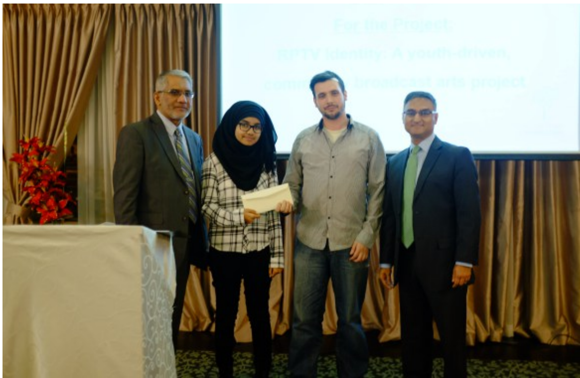
Regent Park Focus Youth Media Arts Centre presented grant by Olive Tree Foundation's Directors

The appreciation dinner included the announcement of two grants awarded to Toronto-based charities. The Foundation awarded a grant to Regent Park Focus Youth Media Arts Centre for the project, RPTV Identity: A youth-driven, community broadcast arts project .